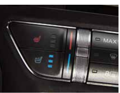
EcoBoost. Interior & Wheel Package. Available equipment. EcoBoost Premium. Heated and cooled front seats. EcoBoost Premium. Illuminated door-sill plates.

EcoBoost Premium. Ceramic leather trim. Available equipment.