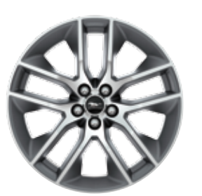
20" x 9" Foundry Black-Painted Machined Aluminum Optional: EcoBoost Premium