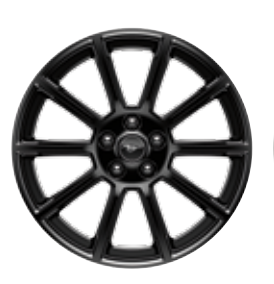
19" Black-Painted Aluminum Included: Black Accent Package

Spoiler delete (n/a with California Special) Voice-activated Navigation System