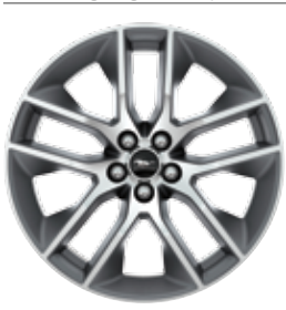
20" x 9" Foundry Black-Painted Machined Aluminum Optional: GT Premium

SYNC® 3 which includes 8" colour LCD touch screen in centre stack with swiping capability, 911 Assist, 911 AppLink<sup>™</sup> and 2 smart-charging USB ports