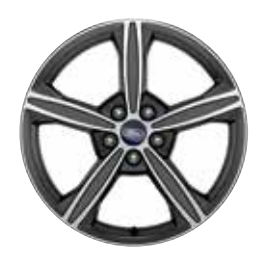
18" 5-Spoke Machined and Painted Aluminum Included: Terracotta Package