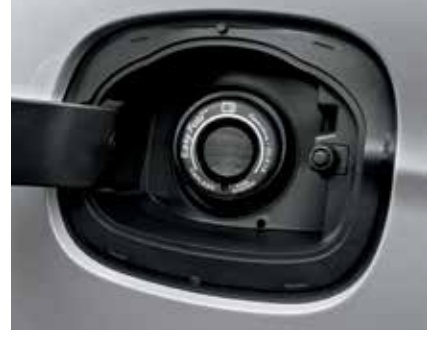
SE. Ebony cloth trim with red stitching. SE Appearance Package. Available equipment.

4.2" LCD centre stack display. 60/40 split fold-flat rear seat. Easy Fuel® capless fuel filler.