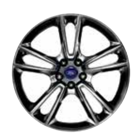
19" H-Spoke Dark Stainless-Painted Aluminum Optional