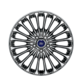
18" Polished-Face with Flash Grey-Painted Pockets Standard