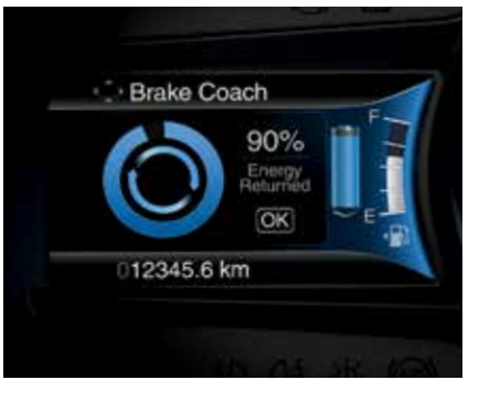
SmartGauge with EcoGuide instrument cluster. Available equipment.