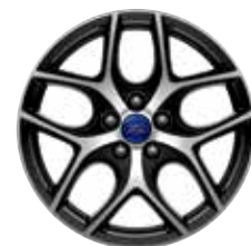
17" Machined Aluminum with Black-Painted Pockets Included: SE Sport Package Optional: SE Plus Package