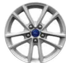
16" Painted Aluminum Standard: SE