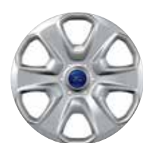
15" Steel with Silver-Painted Covers Standard: S