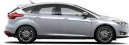
Ingot Silver Metallic