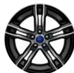
18" Rado Grey-Painted Aluminum Standard