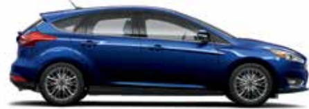
Kona Blue Metallic