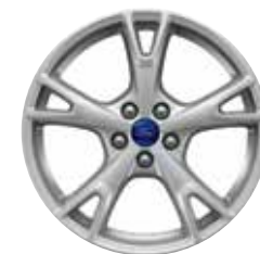
18" Premium Painted Aluminum Included: Titanium 18" Wheel Package