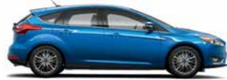
Blue Candy Metallic Tinted Clearcoat