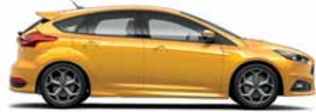
Tangerine Scream Metallic Tri-coat (ST only)