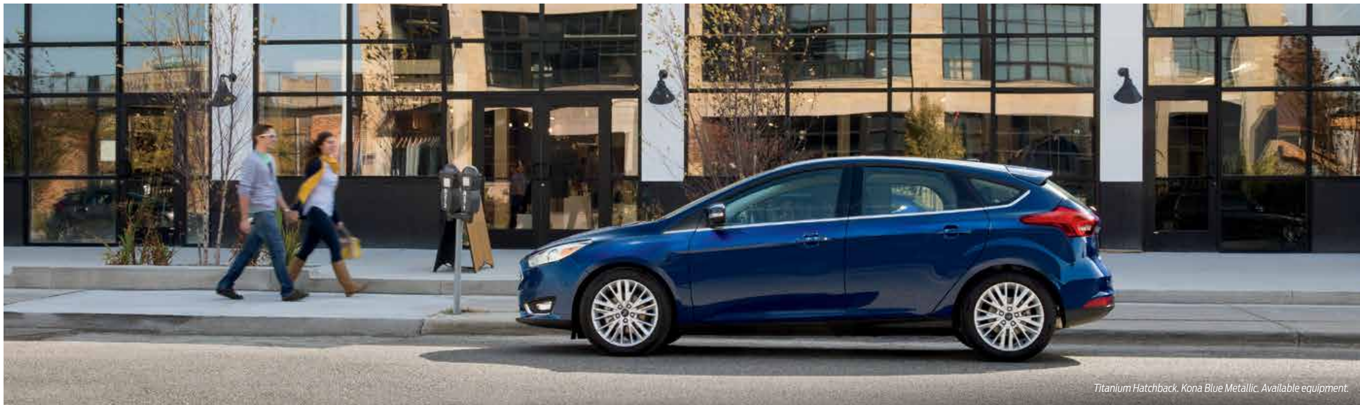
Titanium Hatchback. Kona Blue Metallic. Available equipment.