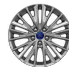
17" Sport Painted Aluminum Standard