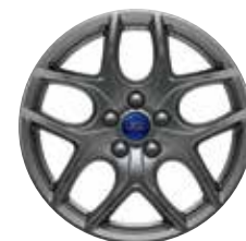
17" Sparkle Nickel-Painted Aluminum Included: SE Plus Package