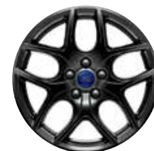
17" Gloss Black-Painted Aluminum Included: SE Plus Black Package Optional: SE EcoBoost Appearance Package

SE. Charcoal Black cloth trim. Available equipment.