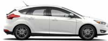
White Platinum Metallic Tri-coat

Exteriors This helpful guide is intended for selecting an exterior colour – not features, options or a trim level.