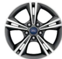
16" Machined Aluminum with Dark-Painted Pockets Included: SE EcoBoost Appearance Package