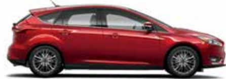
Ruby Red Metallic Tinted Clearcoat